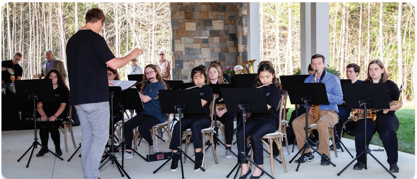
The Williamsburg Youth Orchestra, a WCF grant recipient, performed for community members at the 2022 Spring Celebration fundraiser.