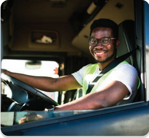
The Economic Mobility Fund is designed to help provide money for the certification process of many well-paying careers.