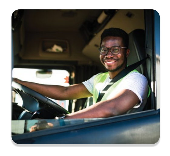
The Economic Mobility Fund is designed to help provide money for the certification process of many well-paying careers.