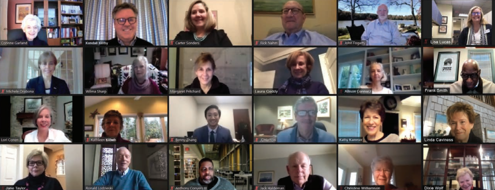
▲ 2020 Board of Directors meeting over zoom.