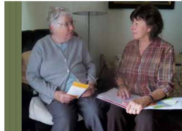
A Faith in Action volunteer provides information to one of the organization's clients to help her identify and navigate the services available to help her to age in place